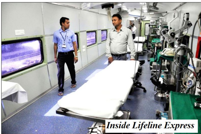
Inside Lifeline Express